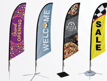
OUTSIDE VENUE FLAGS