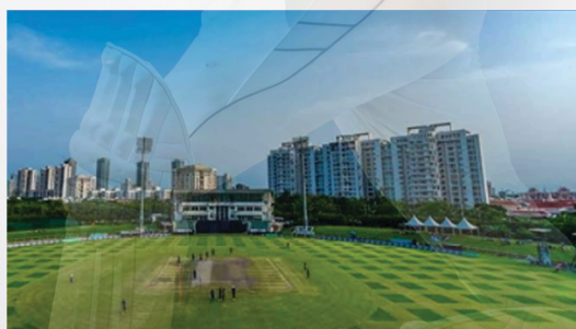
GREATER NOIDA STADIUM