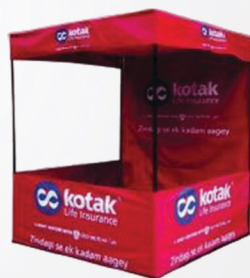
CANOPY TO BE SETUP BY THE SPONSOR