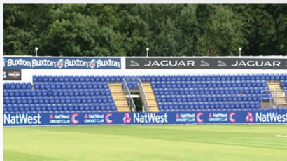
BANNER AROUND BOUNDRY