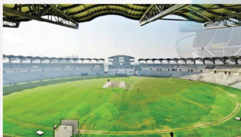
ARUN JAITLEY STADIUM