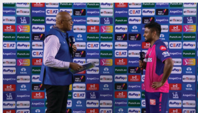
POST MATCH BACKDROP